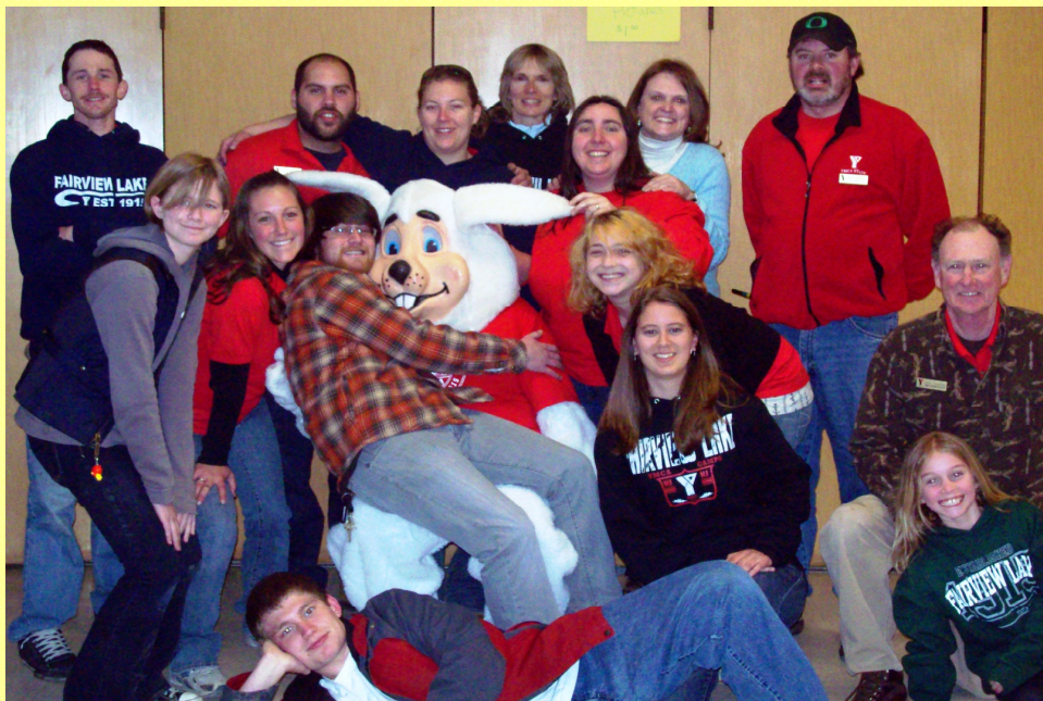
Fairview Lake YMCA staff, volunteers and friends enjoyed a picture with the Easter Bunny

We build strong kids, strong families, strong communities.